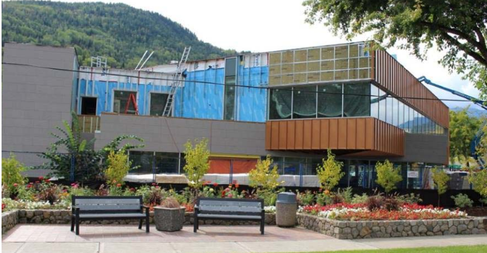
Progress of the TRAIL RIVERFRONT CENTRE, home of the new Trail Museum & Archives on Bay Avenue