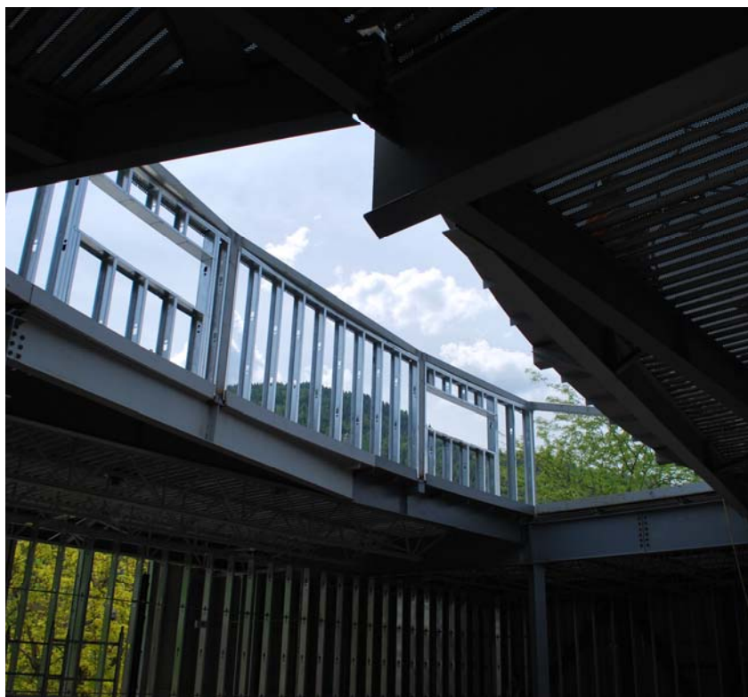
The amazing skylight pouring light over the stairwell of the Trail Riverfront Centre.